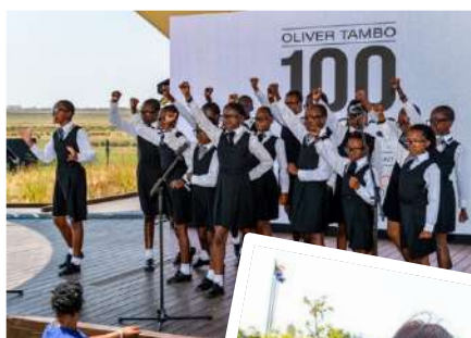
The girls from the Chief Albert Luthuli School performing a play about O.R.