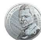
R50 Sterling Silver