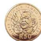
R50 Base Metal