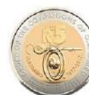
Commemorative R5 Pro